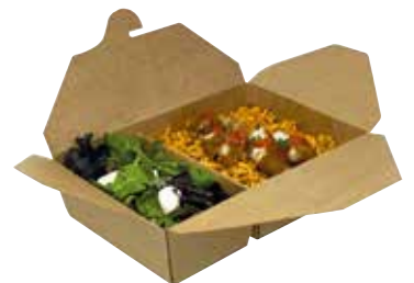
04CTB03K Two Compartment Box Large

✚ 230/200 x 155/140 x 65mm 🍷 Total: 1430ml Small Compartment: 510ml Large Compartment: 920ml 📦 200