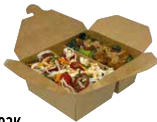
04CTB02K Two Compartment Box Medium

✚ 170/150 x 135/120 x 65mm 🍷 Total: 1050ml Small Compartment: 380ml Large Compartment: 670ml 📦 200