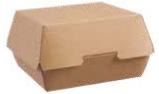
01CSB1BK Kraft Large Clamshell