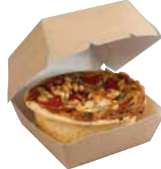
01CSB1AK Kraft Medium Clamshell