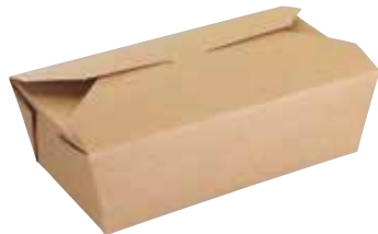
01OR2MK (Kraft) 985ML Multi-Food Box

✚ 185/167 x 103/90 x 58mm 🍷 985ml/ 34.5 UK fl.oz 📦 250