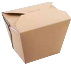
01OR1MK (Kraft) 750ML Multi-Food Box

✚ 118/84 x 97/63 x 92mm 🍷 750ml/ 26 UK fl.oz 📦 250